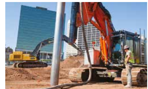
North Hartford Minor League Ballpark North Hartford, Connecticut

Geopier Foundation Company developed the Rammed Aggregate Pier (RAP) system to provide an efficient and cost effective Intermediate Foundation ® solution for the support of settlement sensitive structures. Through continual research and development we've expanded our system capabilities to offer you more. Our design-build engineering support and site specific modulus testing combined with the experience of providing settlement control for thousands of projects provides an unmatched level of support and reliability to meet virtually all of your ground improvement challenges.