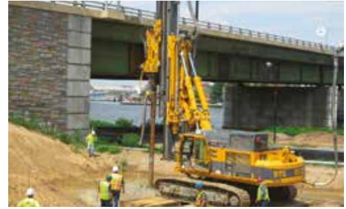
11th Street Bridge Washington, D.C.