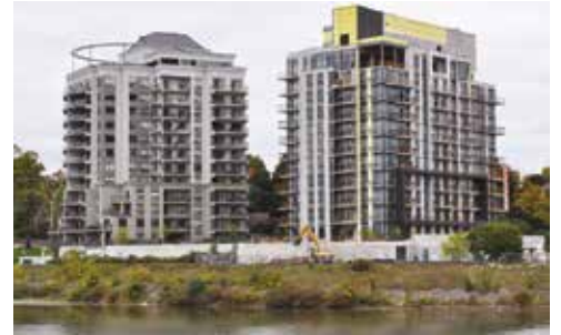
The Grand Condo Cambridge, Ontario